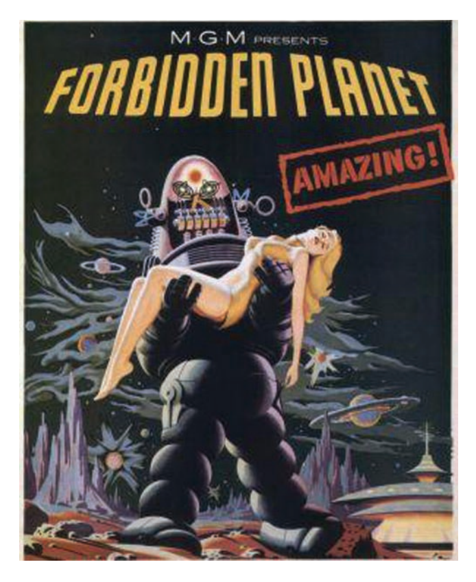
Figure 3. From the Wikipedia entry for the film Forbidden Planet, depicting Robby the Robot.

robot must be made to experience those same conflicts. In a similar way, we assume that robots should have a physical form akin to the human body and artificial intelligence that operates similar to a human brain. Danger arises because we see robots as constrained human beings and assume they possess other human characteristics as well. This is an unfortunate case of attribution error.