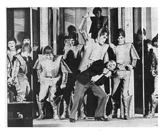
Figure 2. From the Wikipedia entry for Čapek's play, showing the robots in rebellion in the play itself.

tradition, the robot is meant to appear fundamentally human and to react in a somewhat human manner, receiving voice input and generating actions often via corresponding voice output and the control of human-type limbs. The robot is thus a surrogate human but, of course, not fully human. Therefore, how a robot reacts now – and potentially will react in the future – is contingent on how we perceive its limitations and constraints. If we reference Asimov, we intrinsically expect the robot to do what we think it should, and therefore a robot has traditionally been considered essentially mindless.